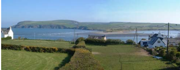
View from the house.

ERW WEN is only a minute from Newport Parrog, with its sands, boating, walks, dunes and estuary .