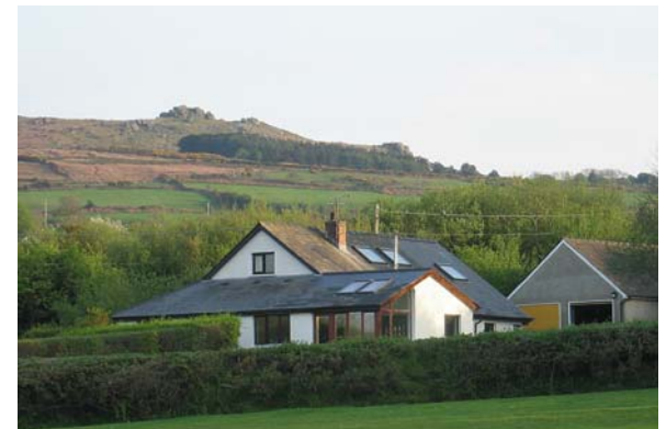
The house from the coastal footpath..

Pembrokeshire Coast National Park: Predominantly coastal, the park has some of the most beautiful coastline in Europe. There are several offshore islands, the largest of which are Skomer, Skokholm, Ramsey, Grasholm and Caldey. These are internationally known for their seabird and seal populations, and the waters around Skomer make up one of only two Marine Nature Reserves in the British Isles. The coast varies from high cliffs to long open beaches. There are sheltered coves, harbours, mud flats and dunes. In contrast are the wooded slopes of the Gwaun Valley and the windswept expanse of the Preseli Hills. Welsh is widely spoken in the area although you will have no problems being understood.