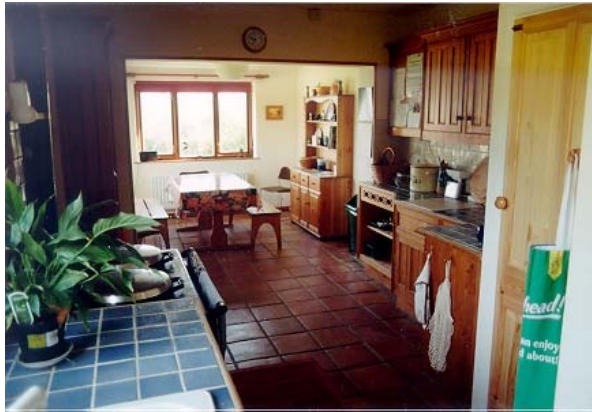
The kitchen/dining area.

Accommodation/Details: 6 bedrooms - sleeps up to 9 comfortably. 3 bathrooms.